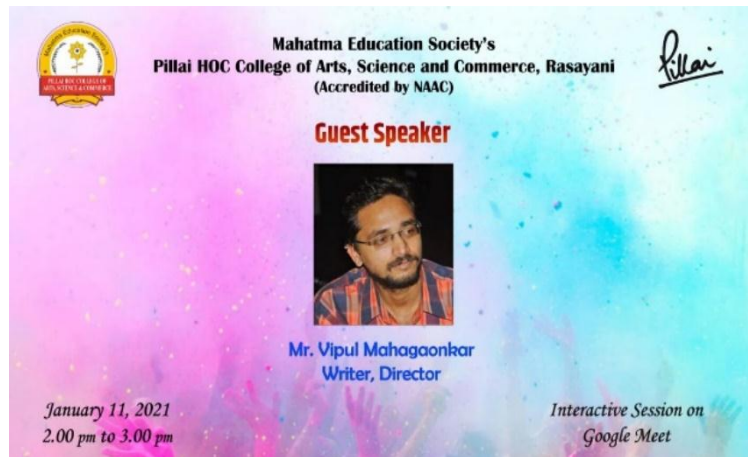
Guest Speaker addressing to the students on the topic